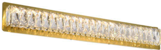
Gold Item No:3502W32G